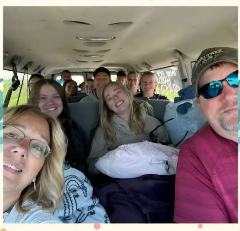
Youth Mission Trip 2025