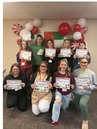
Christmas party fun for high school youth group.