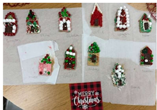
Christmas party for 4th-6th grade. We had some beautiful houses created before we ate them!! Lots of fun and laughter with games and gifts.