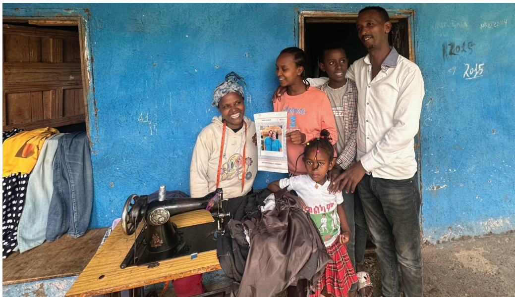
The gift of a sewing machine enabled this tailor to better provide for her family. To learn more, read “Building Friendships that Ignite Hope” beginning on page 4.