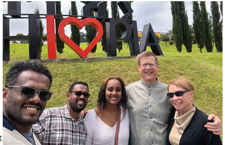
"We love Ethiopia" with CHC leaders