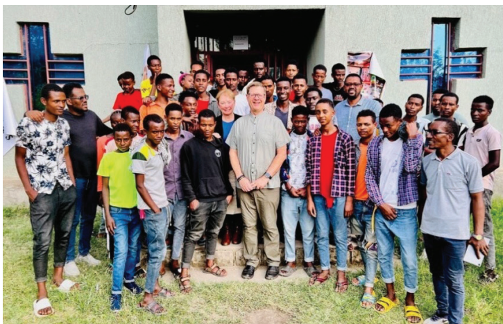
left: Together with our Chapa friends

One of my early concerns was for the families. How could they choose just one young person to support with education, healthcare and training, but leave out their brothers and sisters? What I saw was an amazing empowerment of each young person's family that enabled them to provide well for those brothers and sisters. The work of family empowerment was astonishing. It was equally encouraging to see the strength, confidence and joy in the parents who were now successfully providing for their children and developing a hope for the future all of their children.