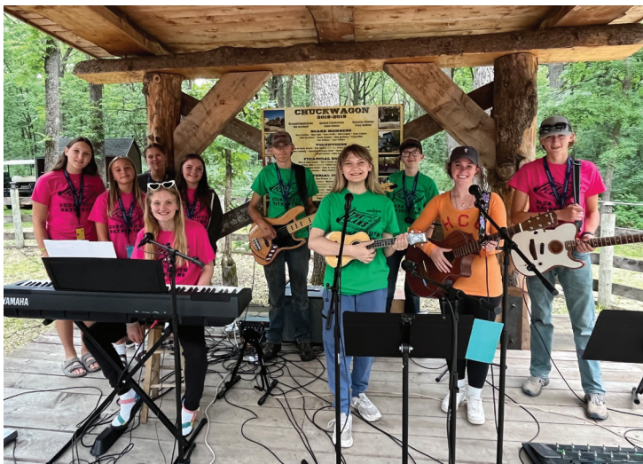
Praise Team from Rushford Lutheran + Spirit of Joy in Weddington, NC, at our outdoor worship session.

After a flurry of phone calls, emails, and Zoom meetings, a venue was secured, along with a worship