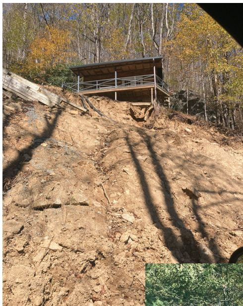
Two of the thousands of disaster scenes in the aftermath of Hurricane Helene

Way to go Church! Thanks for being the generous hands and hearts of Jesus.