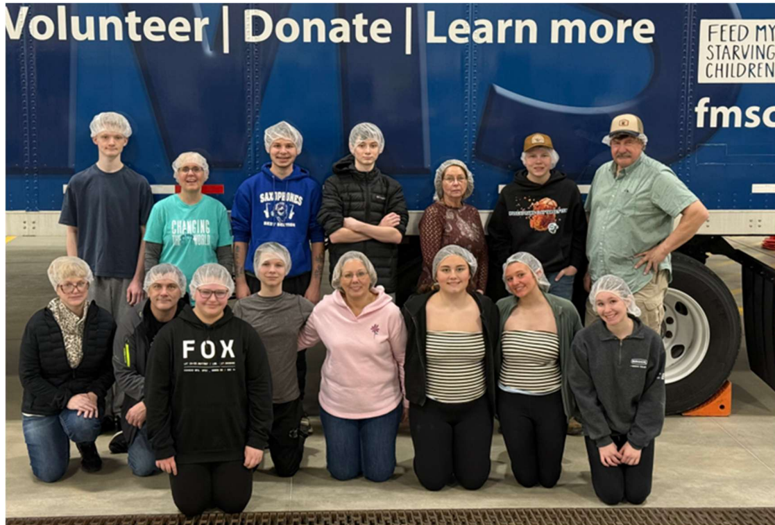
Feed My Starving Children event in Grand Forks on April 25th