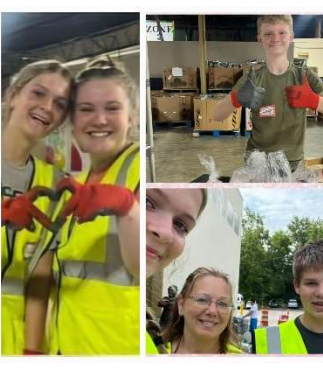
Service day #4: Serving at St Vincent Food Pantry by assisting customers, bagging produce and helping with carts.

Indy 500. We did one lap around the track a little slower that the 190 mph average though! Kids were able to "kiss the bricks". Fun tour!! 🚙 💥